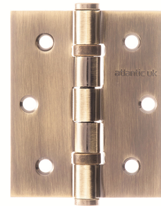
Product Finish Pictured: Antique Brass